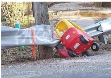
Just how fast was this little kid going?

According to the recently released Global Report on Food Crises, nearly 193 million people are in need of urgent assistance, an increase of nearly 40 million since 2020. Caritas Australia has launched the Africa Food Crisis Appeal to provide urgently needed humanitarian aid to countries in the Horn of Africa, including Ethiopia, Somalia and Eritrea.